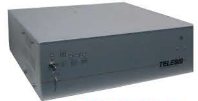
Model C10 Controller