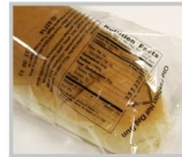
Thermal print nutritional information