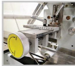
Adjustable bag former