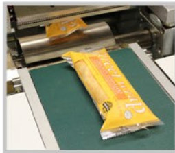
Food in printed film