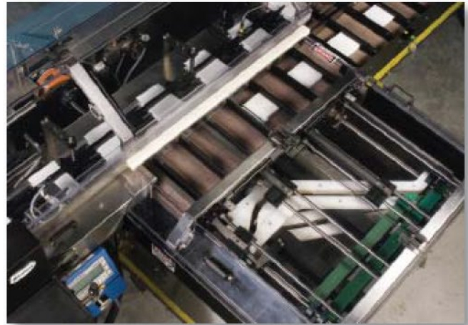
Optional Barrel Cam Product Loader