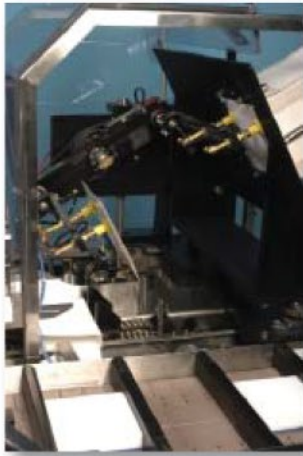
2 Head Rotary Carton Erector